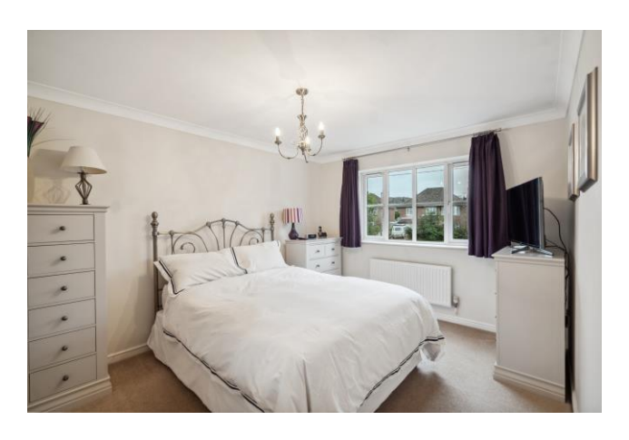
BEDROOM ONE double glazed window to front, fitted wardrobe and radiator.

LANDING with access into loft space, cupboard housing lagged cylinder.